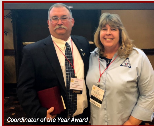
Coordinator of the Year Award