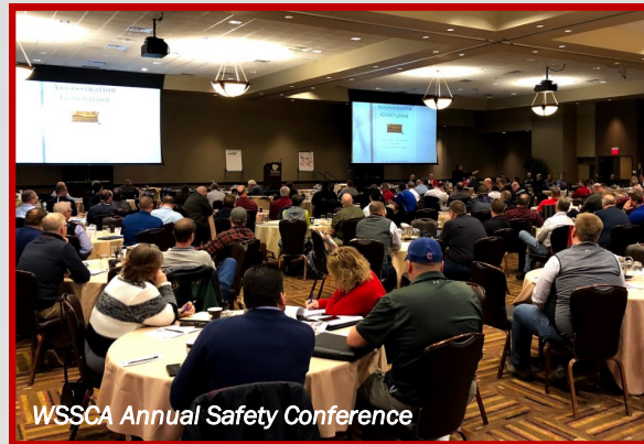
WSSCA Annual Safety Conference

WSSCA is a non-profit and non-government organization that includes administrators, supervisors, teachers, building and grounds personnel, health and nursing personnel, safety administrators, school districts as well as private / public businesses through district, corporate and student memberships. The business of the association is conducted by a thirteen member Board of Directors with guidance from several advisors. Our mission is simple. Make schools safe!