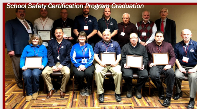
School Safety Certification Program Graduation